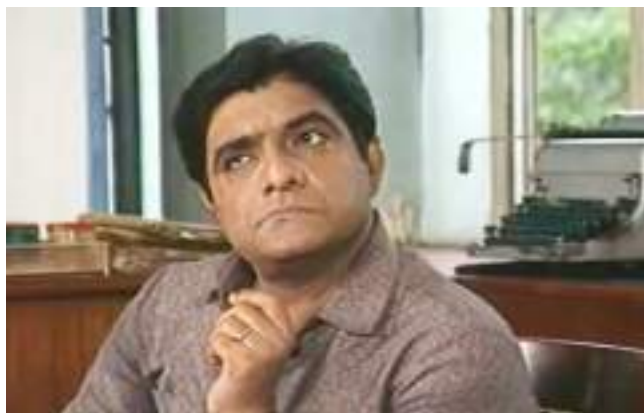
Wagle, the relatable common man

The sitcom, directed by Kundan Shah was based on the ‘common man’ created by famous cartoonist R.K. Laxman, who also narrated it. Anjan Shrivastav played an ordinary middle-class man, and Bharati Achrekar played his wife, as they struggled through the normal life of ordinary folk, laced with gentle humour. Audiences