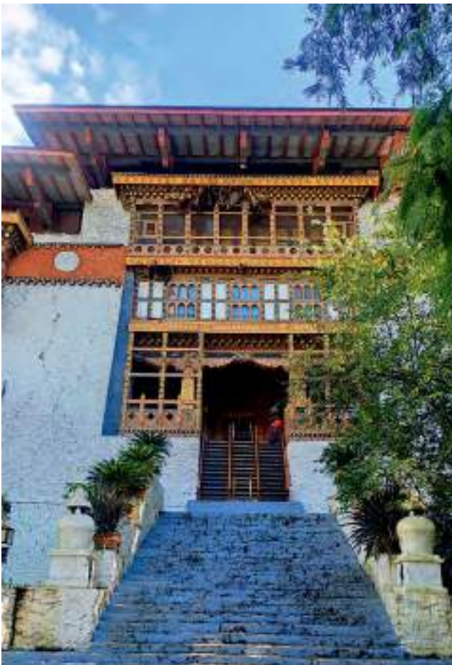
Entrance to punakha monastery

one at Punakha is a must see. The Punakha Dzong was built in 1637 it is called the Palace of Great Happiness or Bliss. It is the second oldest and the second largest Dzong and one of its most majestic with 45 structures within. The Monastery houses relics for which many wars were also fought. It is located at the confluence of the Pho Chhu (father) and Mo Chhu (mother) rivers in Wangdue Valley. Later it becomes Puna Tsang Chu. The monastery itself is surrounded by flowering trees, which make for a pleasant site during spring. The massive architecture with towering exterior walls surrounding a complex of courtyard includes temples, monk's accommodation and administrative offices. To visit one has to be prepared to climb up and down steep staircases without any railing which can be a daunting task.