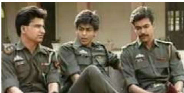
Fauji gave India SRK