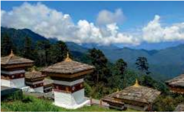
View from dochula

are now housed in the aviary. At the Centre you can know more about the birds as well as see a short informative film.