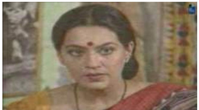
Priya Tendulkar's strident tone would have been meme-worthy today

Basu Chatterjee's sitcom, inspired by Here's Lucy took on a life of its own, when instead of the ditzy housewife his Rajni became a neighbourhood crusader, who fought the bureaucratic incompetence as well as the small injustices inflicted by postmen, telephone wiremen, electricians,