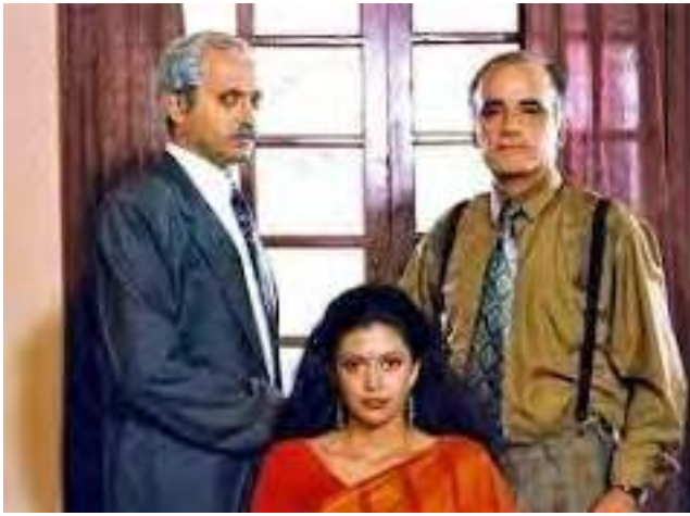
Mandira Bedi is still identified as Shanti

two rich men, whose lives and families have a lot of secrets. She is actually in search of her own biological father, who is one of the two men. DD shows were not meant to be scandalous, but this one broke the mould and opened the doors for other complicated soap operas, and Mandira Bedi is still identified as Shanti.