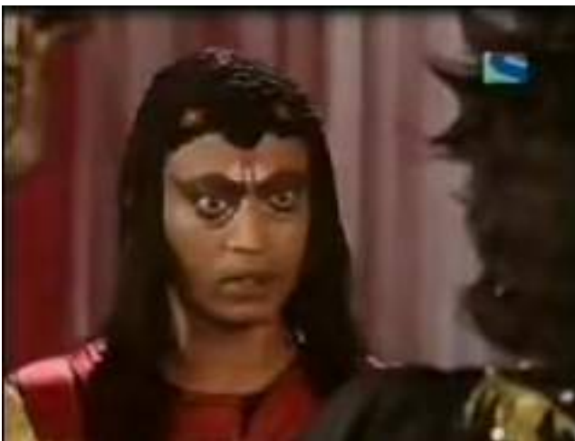
Irfan Khan's performance as a shape-shifting 'aiyar' was unforgettable