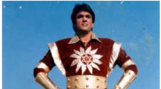
So loved by kids