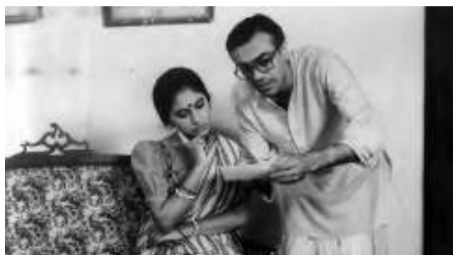
Simple, tasteful, entertaining

Basu Chatterjee directed this series based on the fictional detective created by Bengali writer Sharadindu Bandopadhyay. The Sherlock Holmes-like character, who calls himself a truth seeker, solves cases with his powers of observation and unerring sense of justice. He is accompanied by his Watson like friend, Ajit Kumar Banerjee (KK Raina). Simple, tasteful and entertaining, the acclaimed show was re-telecast on DD National in 2020 during the lockdown.